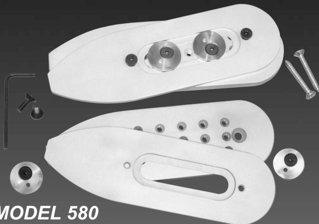
MODEL 580 PAD NOT INCLUDED

The same style adjustable pad plate as used on our GraCoil system. Two eccentric cams provide a nearly unlimited range of adjustments for height, center and rotation. Locks securely to hold your settings. Fifteen mounting holes let you position the recoil pad exactly right, so you get the best possible gun fit.